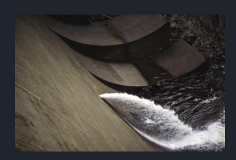
Seamless integration: One team delivering a rewarding experience and consistent quality