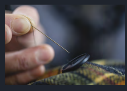
Empowered expertise: Professionals empowered to do the right thing for our clients

We are uniquely placed to fulfil our promise thanks to our ability to combine: