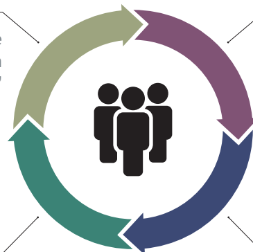
Exhibit 5: Key players have different strengths and opportunities to shape and enhance their customers’ integrated experiences

“I am consistently rewarded for my loyalty to the brand, with no hassle”