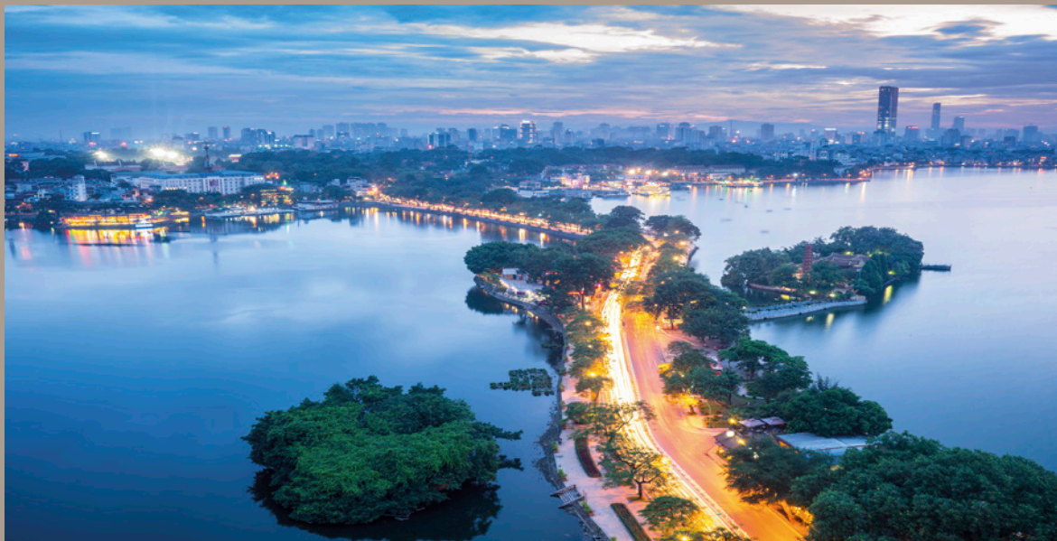
Night view of the West Lake in Hanoi, Vietnam