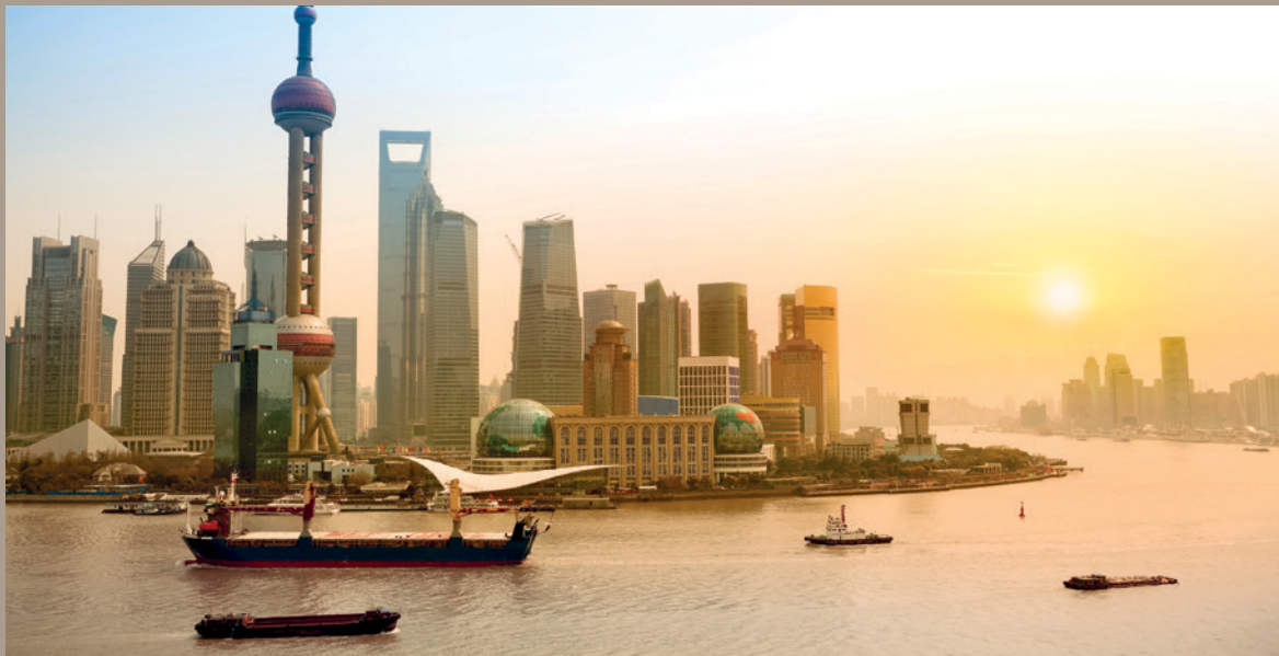
Pudong New Area, Shanghai