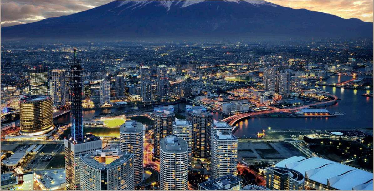
View of Yokohama and Mt. Fuji