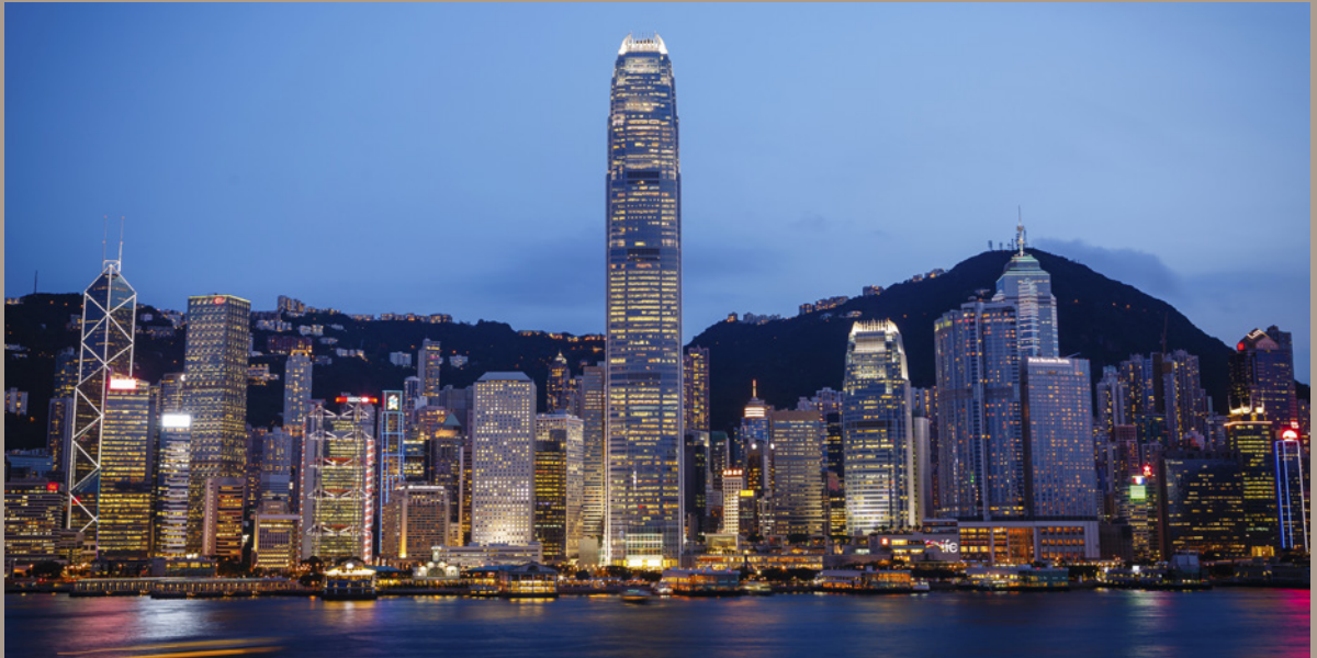
Skyline of Hong Kong