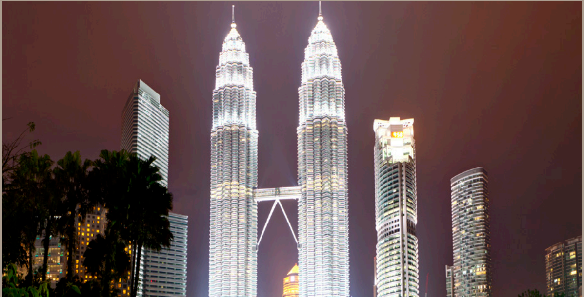
Petronas Towers at night, Kuala Lumpur