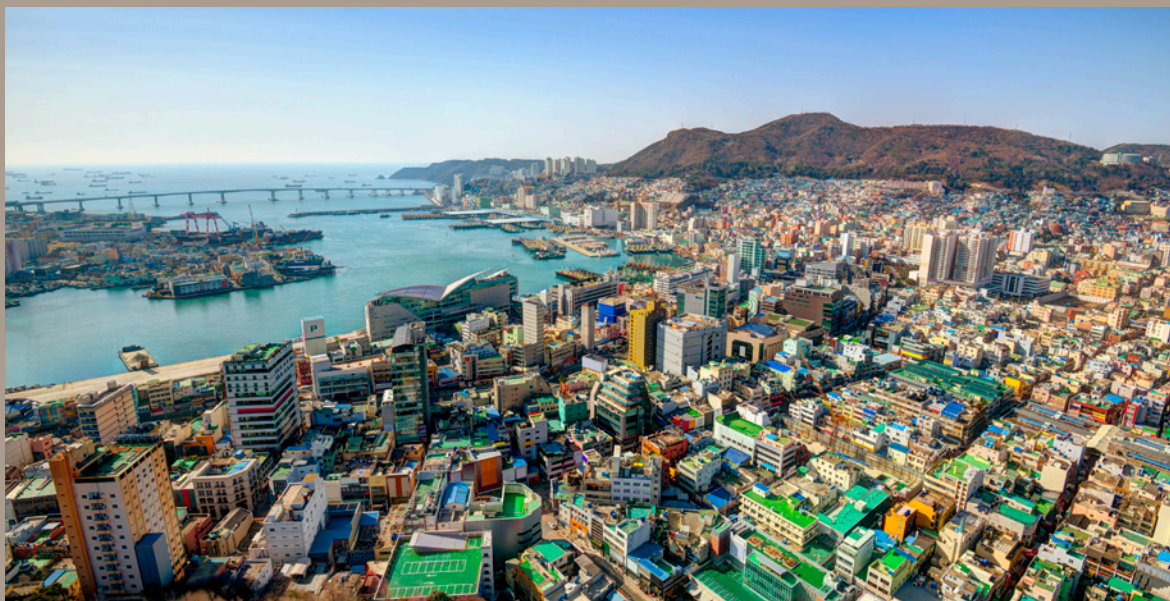
City view of Busan, South Korea