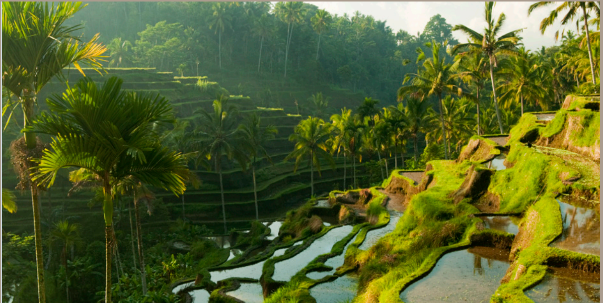
Terrace rice fields in Bali,