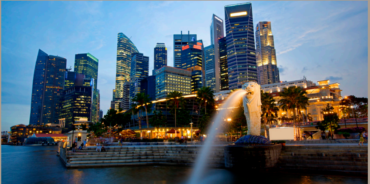
Singapore skyline with the famous Merlion statue