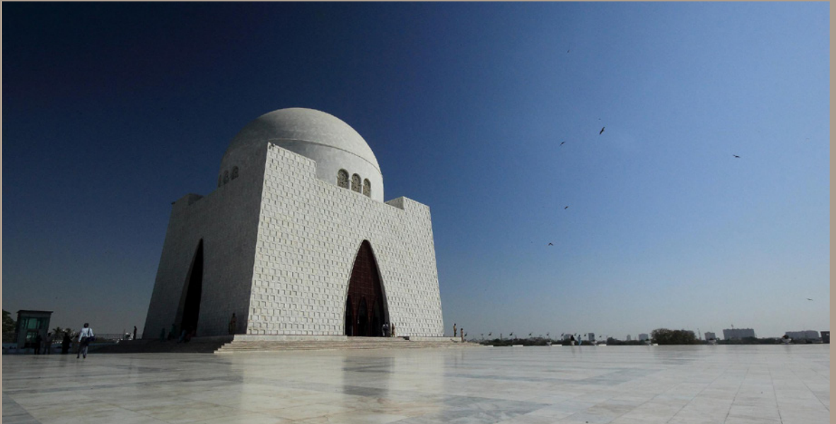
The glowing National Mausoleum of the Founder of Pakistan