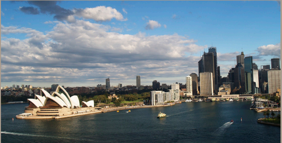
Sydney Opera House,