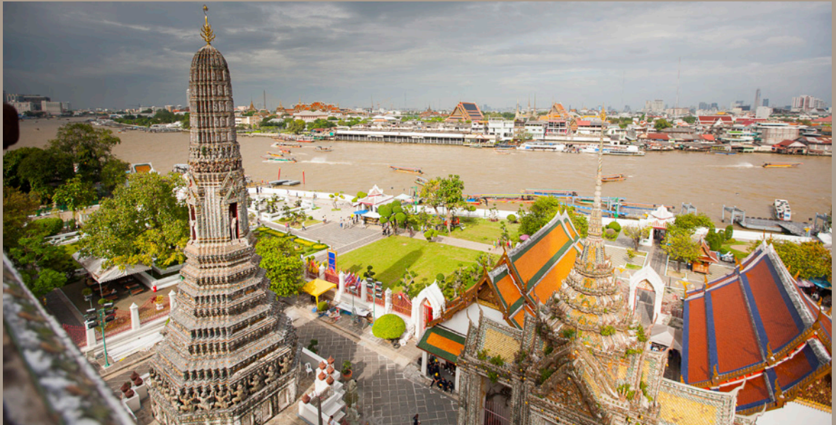
Panorama of Bangkok from Wat Arun temple