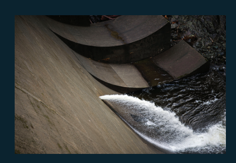
Seamless integration: One team delivering a rewarding experience and consistent quality