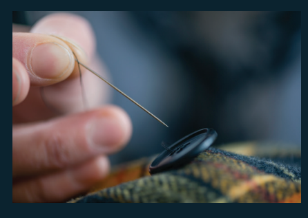
Empowered expertise: Professionals empowered to do the right thing for our clients

We are uniquely placed to fulfil our promise thanks to our ability to combine: