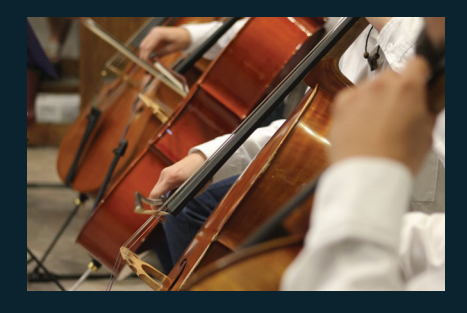
Balanced perspective: Thoughtful counsel that blends local and global perspectives