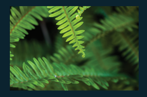
Social conscience: A mindset that gives clients, investors, markets, regulators and the public confidence that we do what is right

6 Mazars Mazars at a glance 2020/2021 Mazars